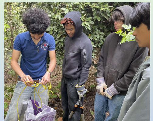
STREAM~N Team youth prepare a trap for emerald ash borer research after being trained by local experts.