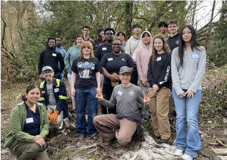
STREAM~N Team members feeling great after ecological restoration work.

STREAM~N Teams address critical issues impacting their communities, while developing career readiness, critical thinking, creativity and teamwork skills.