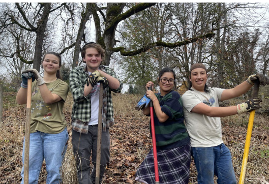
Pausing during oak savannah restoration.

“The service work is really fun and I like learning about careers, water quality and a lot more!”