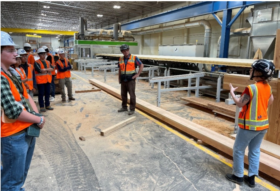
STREAM~N Team youth learn from experts at Timberlab, creators of the innovative 9-acre mass timber ceiling at Portland International Airport.

Questions and volunteers are also welcome!