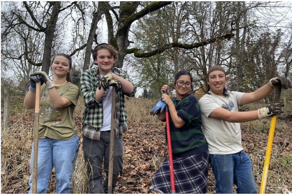
STREAM~N Team members pause during oak savannah restoration work.

STREAM~N Teams address critical issues impacting their communities, while developing career readiness, critical thinking, creativity and teamwork skills.