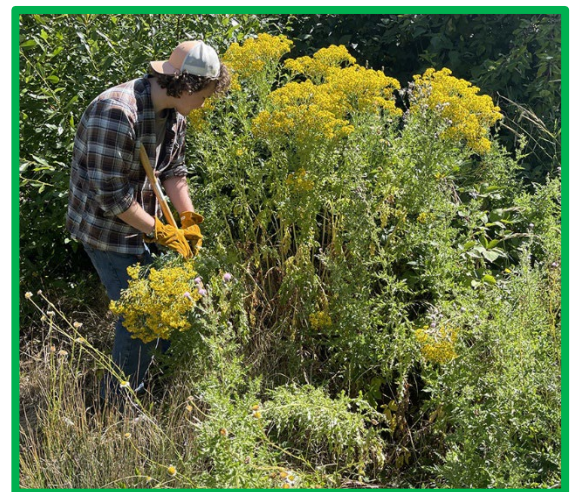
Pulling out invasive—and toxic!—ragwort.

Supported by Oregon Youth Corps and Oregon Forest Resources Institute (OFRI). Thank you, partners!