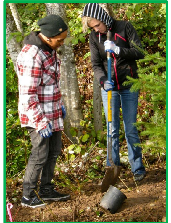
Planting trees near a stream.